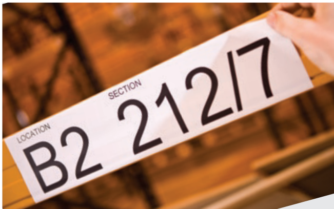
Create temporary warehouse racking identification labels as and when required