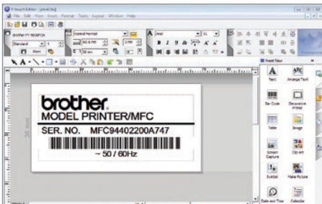
P-touch Editor 5 gives you the creative options to design and print any label required

Connect to non-windows devices using the RS-232 serial port. By sending simple text commands containing the label format and the text/barcode to be printed, the labelling machine will print the label required. No driver or software needs installing.