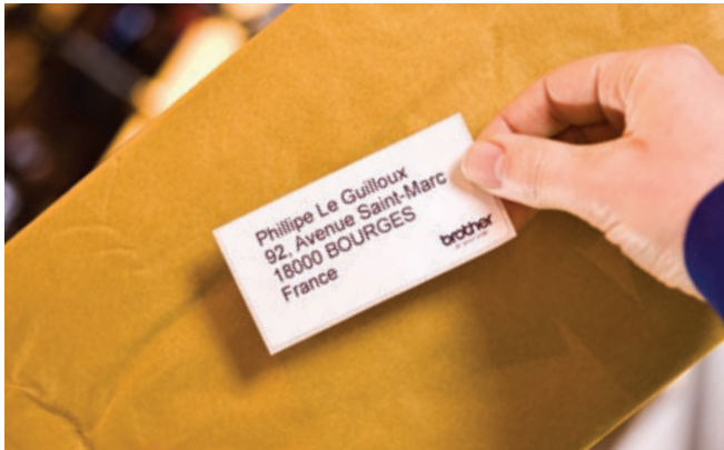
Address labels can be created quickly and easily - you can even incorporate logos or other graphics

With the most common sizes of shipping labels available for the TD-4000 and TD-4100N, and the ability to create custom sized labels using the built-in cutter, there are many uses for these models in the warehouse. Brother RD label rolls are made of high quality materials, ensuring the printed text and barcodes stay readable on the label while items are being shipped.