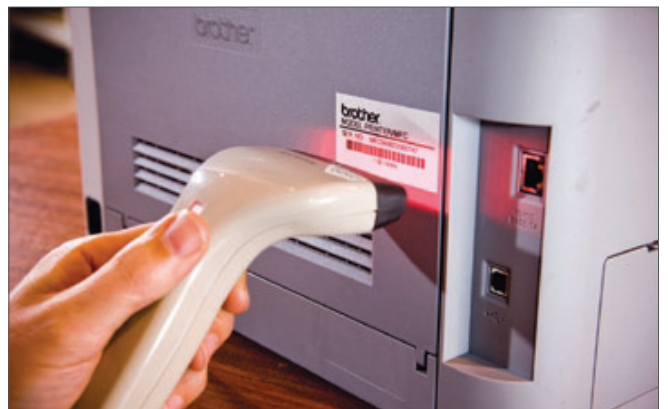
Connect a barcode scanner to the printer's serial port to print labels directly from the TD-4000/TD-4100N*