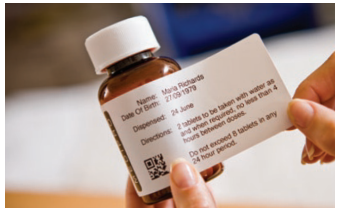
Labels are available in a range of different sizes for the most common labelling applications