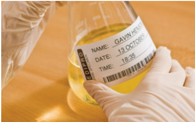
Ensure that patients' specimens are clearly and correctly identified

With the strict regulations on the tracking of patient specimens and other items within the healthcare industry, clear, high quality labelling is essential to maintain safety and traceability. The Brother TD-4100N, with its integrated 10/100 Base TX network port gives the chance to place the machine away from the PC, wherever the labels are needed. With support for the most common barcode protocols, both models are ideally suited to any labelling task.