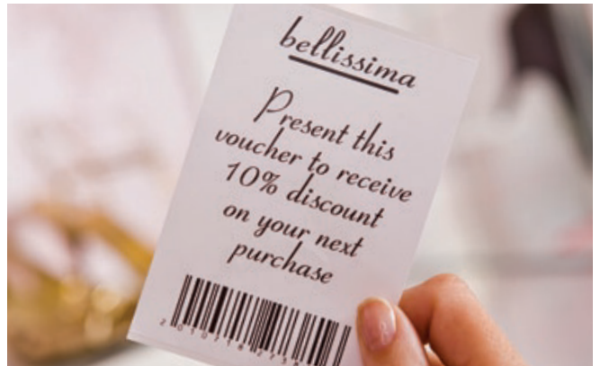
Offer loyalty discounts, or other incentives, to your valued customers with specially printed vouchers