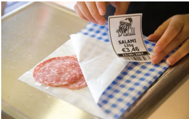
Ensure your customers have all the product and ingredient information required

Easy to read labels are essential to consumers, to help make informed decisions prior to a potential purchase. The 300dpi print resolution and high quality RD label rolls used in the TD-4000 and TD-4100N ensures that every label printed looks professional, offering sharp text, logos and barcodes with a high contrast to ensure faultless scanning at the checkout.