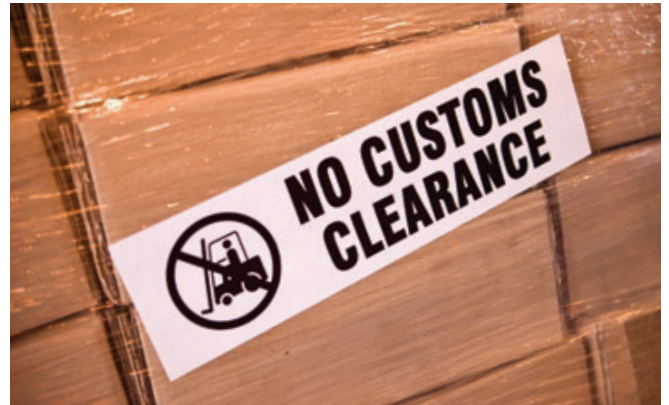
The continuous roll offers the ability to create temporary signage on demand