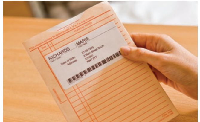
Locate patients' records and other important documentation quickly with an identification label