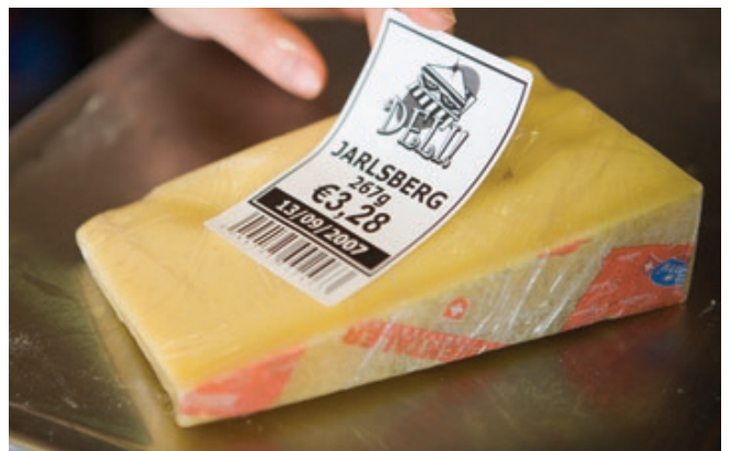
The adhesive used in the Brother RD rolls has been certified safe for food labelling