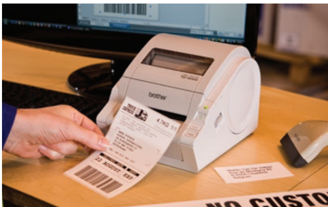
Many different types of labels can be printed with the TD-4000 and TD-4100N

The TD-4000 and TD-4100N use Brother RD labels. Available in die-cut and also continuous length rolls, they offer high quality printing, added protection against marking and scuffing and are available in various sizes. In addition to the standard die-cut rolls found on most label printers, you also have the flexibility to use continuous length rolls with the built-in cutter to make labels and signs up to 3 metres in length.