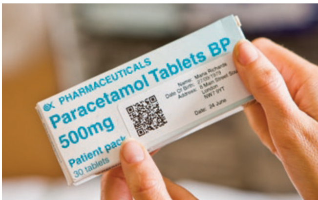
A large amount of data can be recalled instantly by including a 2D barcode on the label