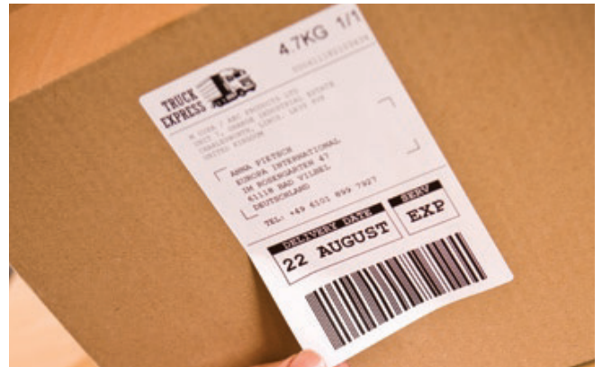
Barcodes, company logos and other information is easily printed up to 4 inch/102 mm wide